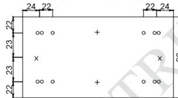
PLAN AT A-A