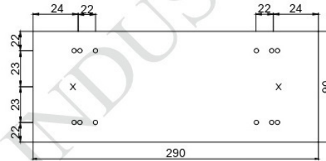
PLAN AT BOTTOM